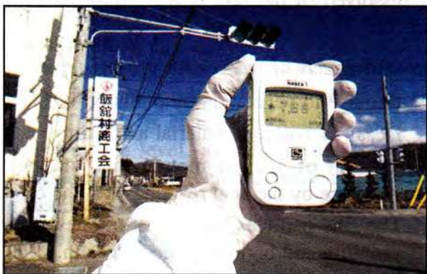
Fig. 15.4 Recording radioactivity levels at a village, about 40 km from the Fukushima Daiichi nuclear power plant in Japan

Nuclear power plants can be the sources of leak of nuclear radiations either through the negligent disposal of wastes or by any accidental explosion of the plant. Two very serious nuclear plant explosions have occurred — one in Chernobyl (Ukraine) in 1986 and the other in Japan (Fukushima Daiichi Nuclear Plant) on 11, March 2011. So many people died and many more suffered radiation exposure causing health problems such as haemorrhaging and even cancers. The chief radiation pollutant was Iodine 131 , which raises the risk of thyroid cancer. Radiation even leaked into the sea and reached humans passively through sea food.