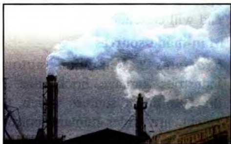
Fig. 15.2 Smoke from factory chimneys

The smoke released by the factory chimneys into the air contains lot of particulate pollutants .