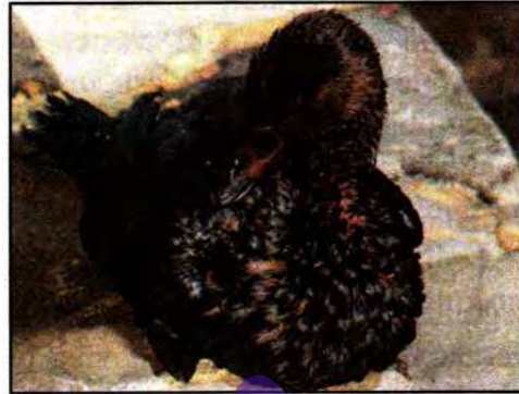
Fig. 15.3 Oil spill affected duck.

Oil spills are the accidental discharges of petroleum in oceans or estuaries. The sources of spills are the overturned oil tankers, offshore oil mining, oil refineries. Oil pollution kills a lot of marine life (fish, birds, etc.). Fig. 15.3 below shows a duck coated with oil.