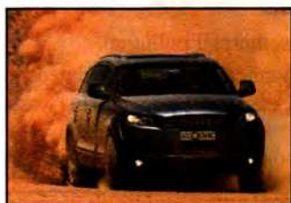
TYRE PARTICULATE AND DUST