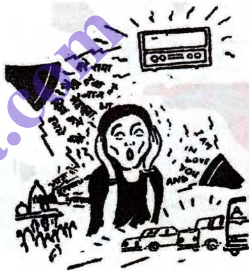
Fig. 15.6 Noise pollution